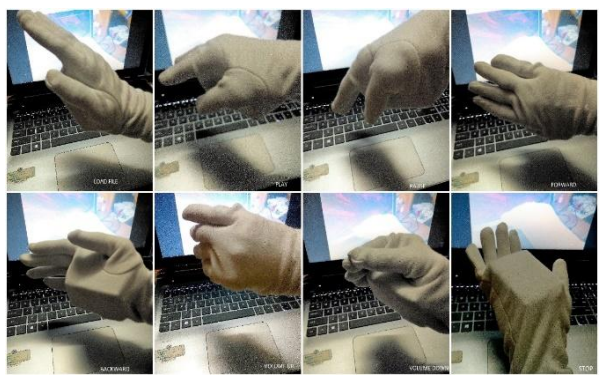
Fig. 3 Hand Gestures for Media player Controls

The accelerometer senses the hand gestures and sends the sensed data to Arduino which processes the data and transmits appropriate control command over Xbee. The Fig.3 shows the different controlling actions.