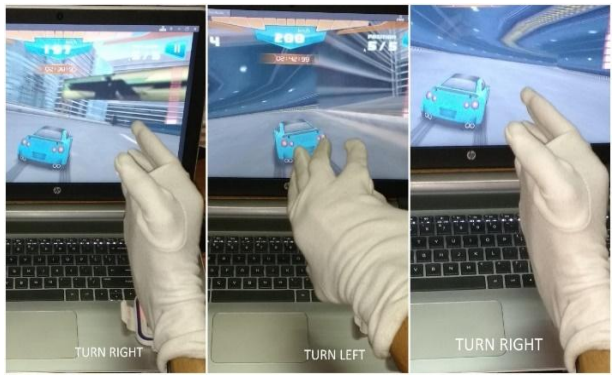
Fig. 4Hand Gestures for Gaming control

Simple example of a gesture controlled car racing game is shown in Fig.4. Here arduino and accelerometer is used for different controlling actions for the car such as boost, turn left, turn right, etc.